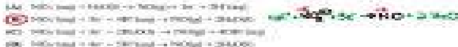
FIGURE 3. What is the coefficient for water when the reaction is balanced in acidic solution? (Coefficients = 1, 2, 3, 4, 5, 6, 7, 8, 9, 10, 11, 12, 13, 14, 15, 16, 17, 18, 19, 20)

Fig. 12. "Effect of the feedback (and) reduction of the system on reaching the lower nitrogen concentration in the sediment."