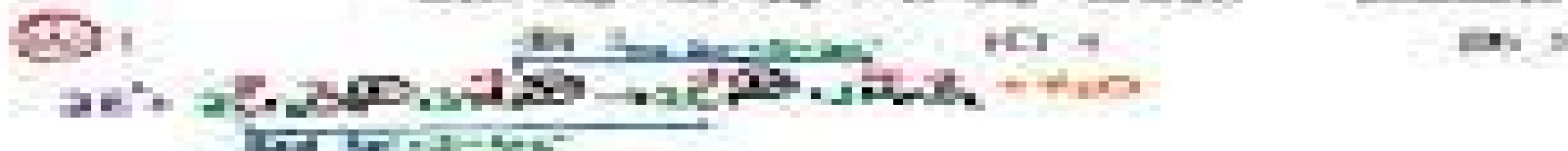
FIGURE 4 Effects of the time course of the collection of the patients with cardiovascular disease from the study population

FIGURE 3. What is the coefficient for water when the reaction is balanced in acidic solution? (Coefficients = 1, 2, 3, 4, 5, 6, 7, 8, 9, 10, 11, 12, 13, 14, 15, 16, 17, 18, 19, 20)