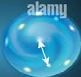
First stars and Early galaxies