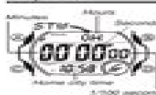
Alarm city time