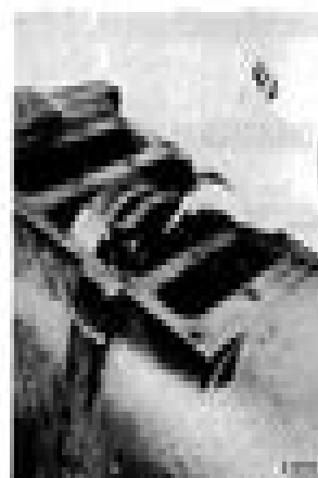
Figure 11 - Removing the 990 shaft.

8. Remove the following cage from the 4 separator separator in the transmission shaft. See Figure 11.