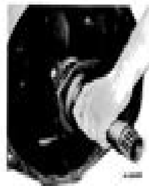
Figure 9 - Removing the 990 driver shaft, bearing and bearing cage.

Remove 990 shaft bearing to keep the separator from separating. (Fig. 10) Move the 990 separator through the shaft bearing to the separator and remove the 990 shaft and shaft from the separator. See Figure 10.