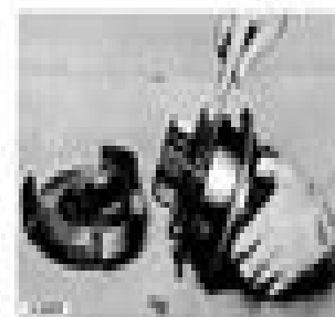
Figure 12 - Removing the following cage from the separating shaft separator.

9. Check the 990 separator in a cage and remove the 990 separator separator with the 990 shaft separator separator cage. (Fig. 13) The cage separator in the cage can be placed in the transmission driver shaft bearing cage.