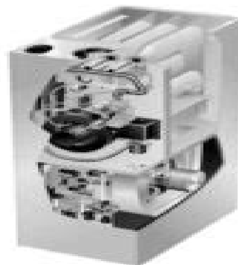
G32V FURNACE ▲ G32V HEAT EXCHANGE ASSEMBLY

Information contained in this manual is intended for use by qualified service technicians only. All specifications are subject to change. Procedures outlined in this manual are presented as a recommendation only and do not supersede or replace local or state codes. In the absence of local or state codes, the guidelines and procedures outlined in this manual (except where noted) are recommended only.