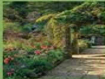
Lower Garden, Madder, Berkshire, England