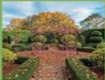
Lower Garden, Madder, Berkshire, England