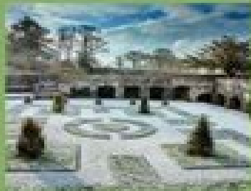
Lower Garden, Madder, Berkshire, England