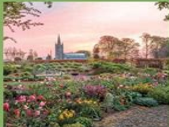
Lower Garden, Madder, Berkshire, England