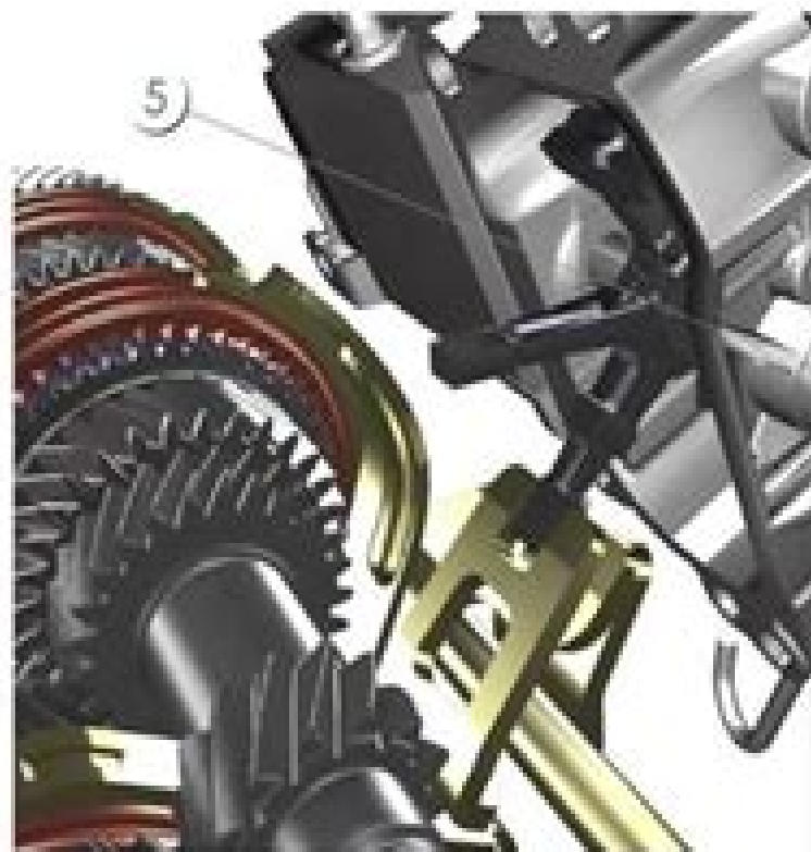
Système S-Com S-Com system