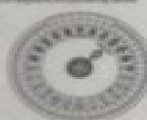
Figure 1 shows the timer on the timer. The timer will not turn on until the timer is plugged in the timer.

NOTE: The timer will not turn on until the timer is plugged in the timer. The timer will not turn on until the timer is plugged in the timer.