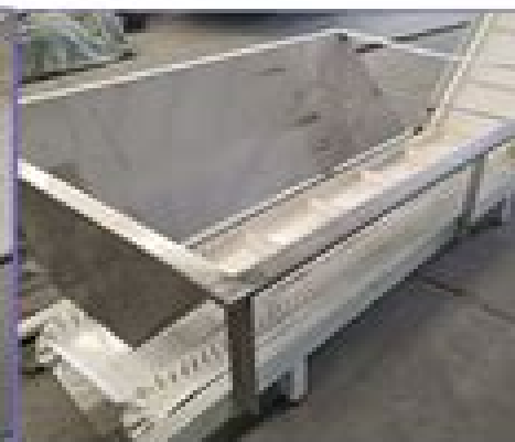
Feeding hopper (to prevent product spillage during delivery)