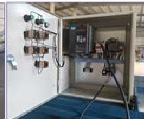
Electric control box (automatic start and stop)