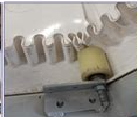
Corrugated ribs (to prevent product from falling)