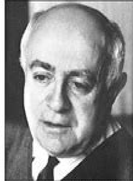
Theodor W. Adorno

“In the most general sense of progressive thought, the Enlightenment has always aimed at liberating men from fear and establishing their sovereignty. Yet the fully enlightened earth radiates under the sign of disaster triumphant.”