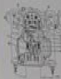
Diagram illustrating the components of a carburetor assembly, including the float valve, needle valve, and other internal parts.