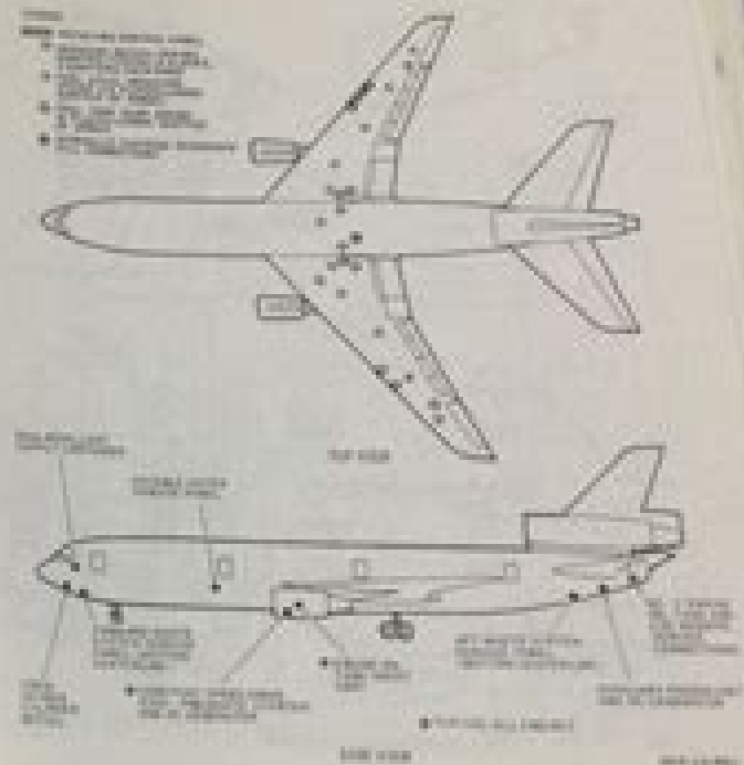
FIGURE 1 AIRCRAFT MAINTENANCE POINTS