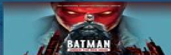
Batman: Under the Red Hood