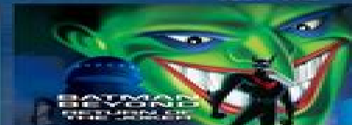
Batman Beyond: Return of the Joker