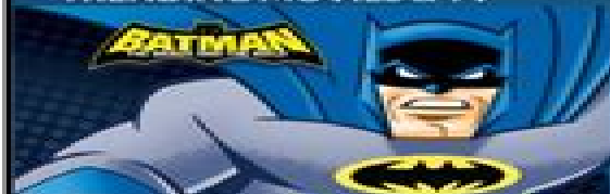
Batman: The Brave and the Bold