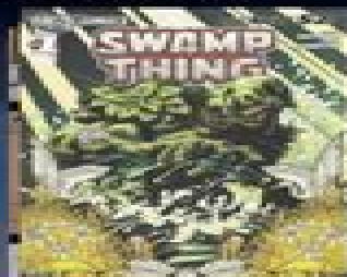
Swamp Thing (2011-) #1 Issue #1