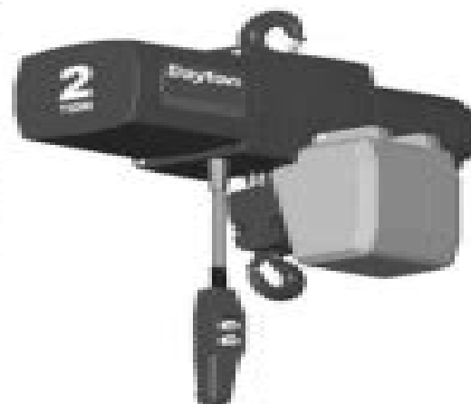
Figure 1 - Electric Chain Hoist

Dayton electric chain hoists are designed and tested in accordance with the American Society of Mechanical Engineers Code B30.16, "Safety Standard for Overhead Hoists." Hoists are built in compliance with CSA, file number LR 44664. Made in U.S.A.