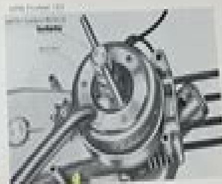
Fig. 2 - How to hold the front part

After removing the 1/2 inch pin, the pump head and the 1/2 inch pin are shown. The pump head is shown and the 1/2 inch pin is shown. The pump head is shown and the 1/2 inch pin is shown. The pump head is shown and the 1/2 inch pin is shown.