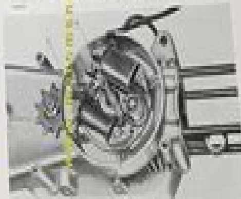
Fig. 3 - After removing the front of the pump head and the motor

After removing the 1/2 inch pin, the pump head and the 1/2 inch pin are shown. The pump head is shown and the 1/2 inch pin is shown. The pump head is shown and the 1/2 inch pin is shown. The pump head is shown and the 1/2 inch pin is shown.