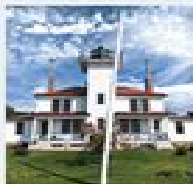
Reference photos for the Raspberry Island Lighthouse (p. 16)

The lands within the National Park system contain some of the most beautiful places in this country. I've created many prints for the Apostle Islands National Lakeshore and I expect I'll do more for this park and others I've visited around the country.