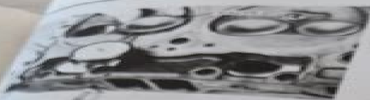
Fig. 13—Measuring Valve Guide Wear

...at degree angle. The exhaust valve ... degree angle. The valve face and valve ... in (Fig. 13).