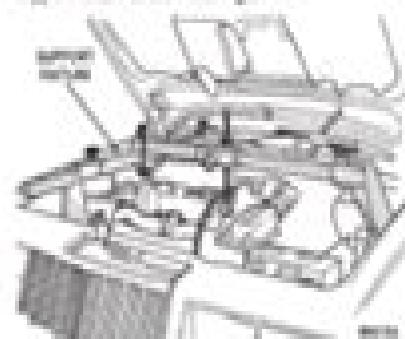
Fig. 1 Engine Support Fixture