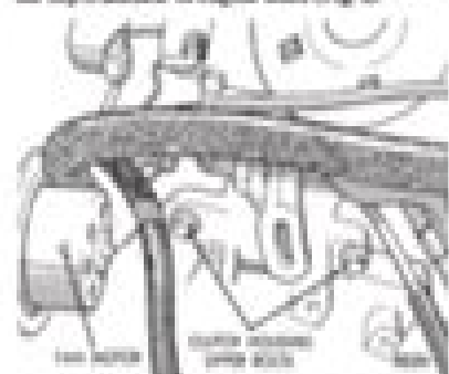
Fig. 3 Remove or Install Balls

When removing or installing the transaxle, it may be helpful to use locating pins to place of the top transaxle to engine hole (Fig. 3).