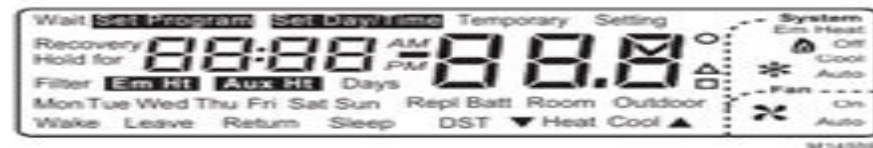
Fig. 11. Display of all LCD segments.