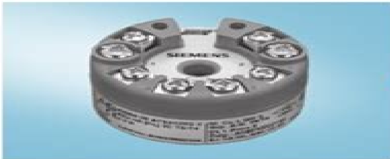
SITRANS TR400 Fieldbus Transmitters