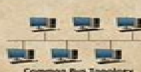
Common Bus Topology