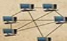
Mesh Network Topology