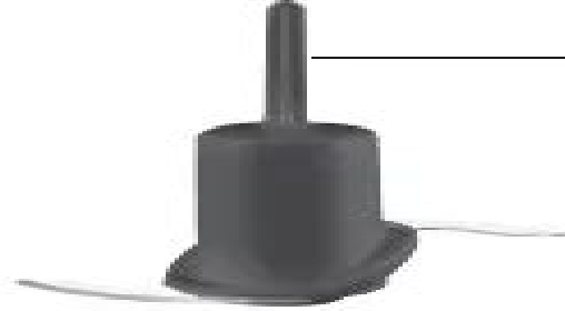
Cuisinart® SmartPower® Blade