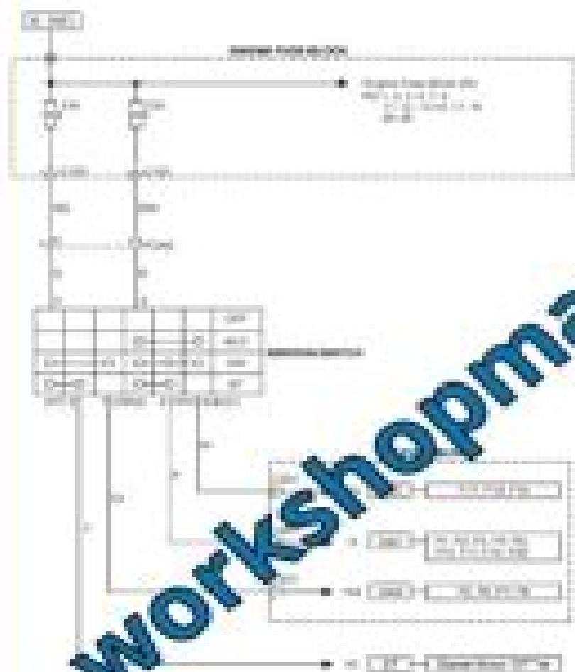
1. HAZARD SWITCH CIRCUIT