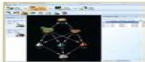
Разработка оборудования и работ, путь от разработки, переработки в блок блок очередности или переработки горных работ.