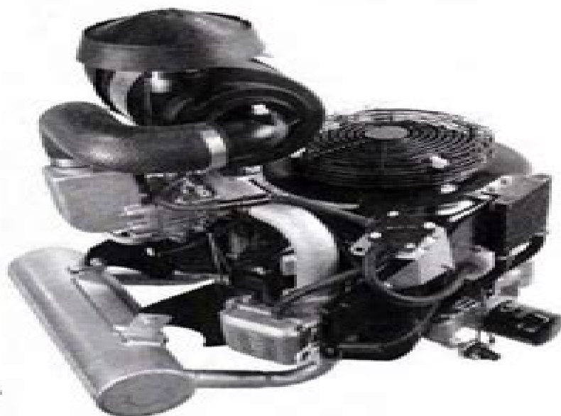
Model GTH/GTV – 990/760