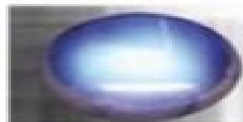
Blue moon stone