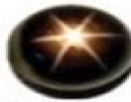
Golden star sapphire