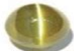
Chrysoberyl cats eye