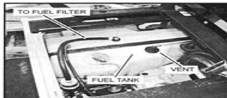
Figure 3-3 Fuel Tank – Diesel Vehicles