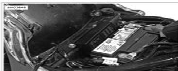
Figure 8-11. Fuse Block Cover (FXCW/C)