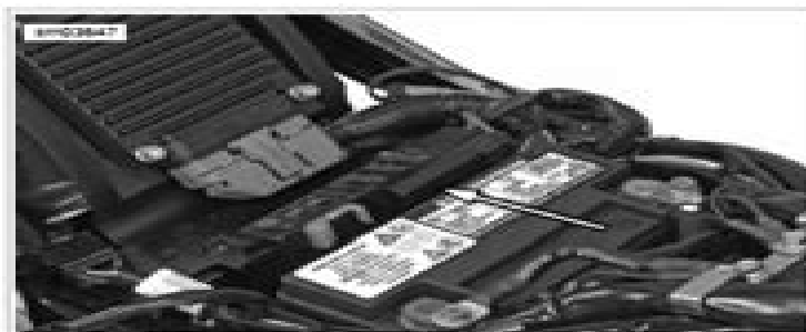
Figure 8-10. Fuse Block Cover (All Except FXCW/C)