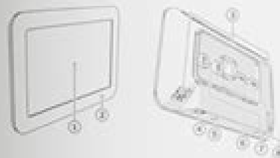
Figuur 2 De belangrijke onderdelen Toon