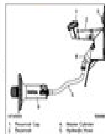
Fig. 5 Clutch Hydraulic Fluid Level Checking

If the fluid level is below the MIN line, fill the reservoir with DOT 3 brake fluid until the level reaches the MAX line. See Fig. 5.