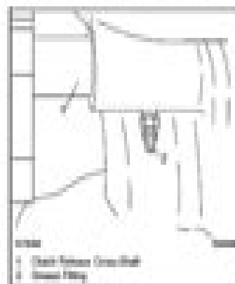
Fig. 3 Clutch Release Cross-Shaft Grease Fitting

The clutch release cross-shaft is equipped with two grease fittings in the transmission clutch housing. See Fig. 3 and Fig. 4. Wipe the oil from the grease fittings and lubricate with multipurpose chassis grease.