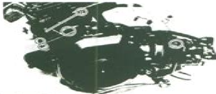
1. Drive select lever