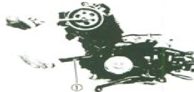
1. Universal rotor holder

recoil starter pulley with the universal rotor holder.