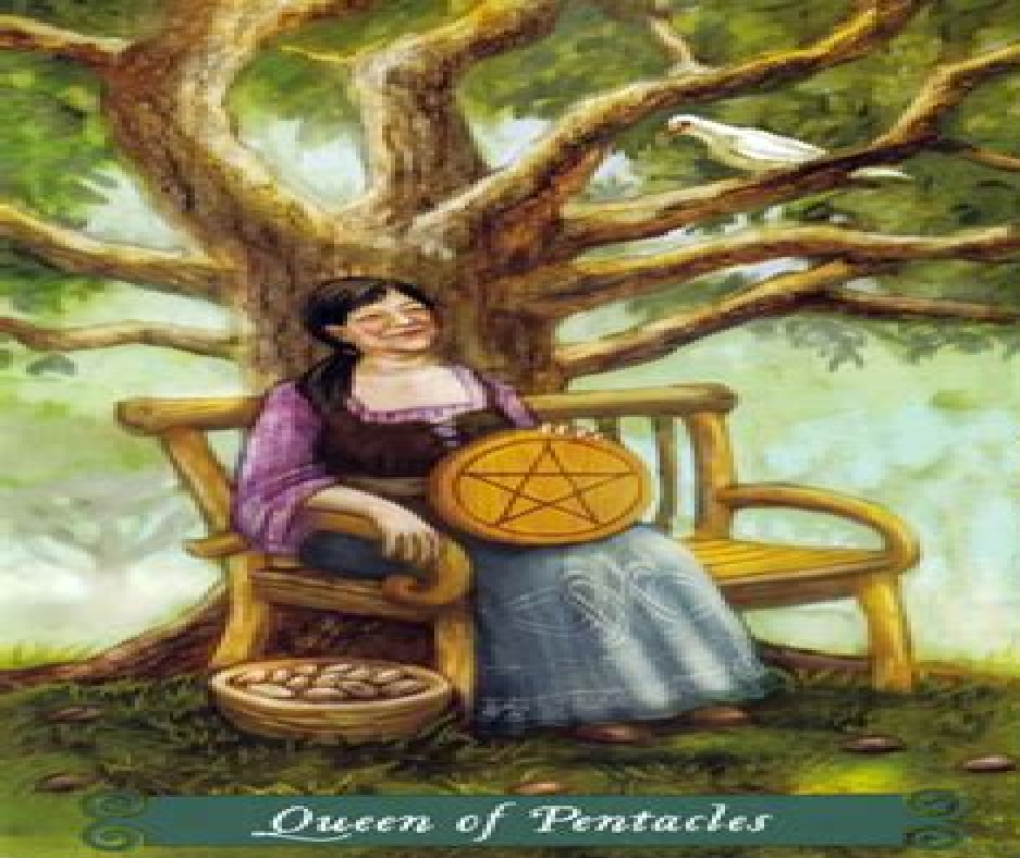
Queen of Pentacles