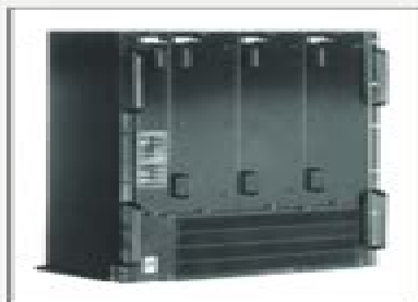
The rack-mounting amplifier, with Audio Processing Unit.