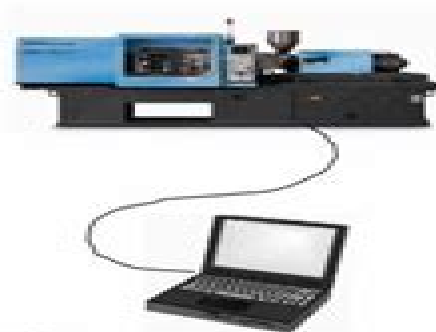
Examples of recorded values and graphics

Connecting the Machine to a PC (for the archiving of process data and graphics)