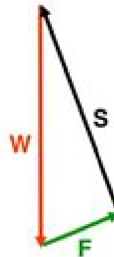
Triangle of forces