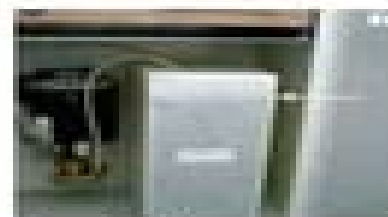
Figure 1-4 Spindle cooler reservoir.