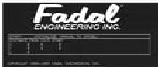
Figure 1-6 Screen display following power-on.

The Fadal logo will display on the monitor screen of the pendant when the VMC is powered on (See Figure 1-6).