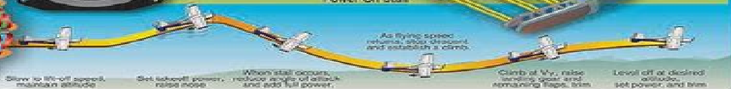
Power On Stall