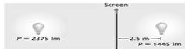
■ Figure 16-7 (Not to scale)