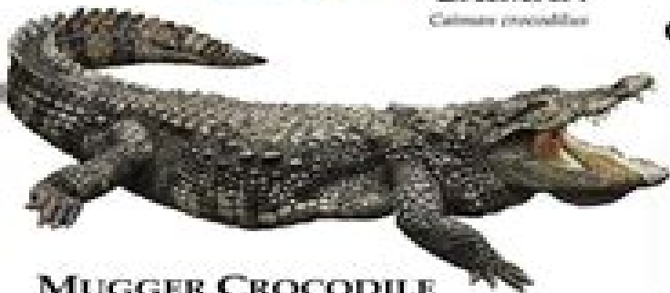
MUGGER CROCODILE Crocodylus palustris