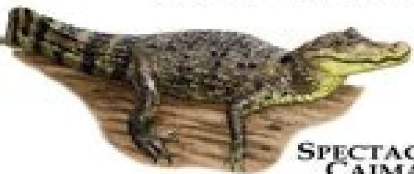
SPECTACLED CAIMAN Caiman crocodilus