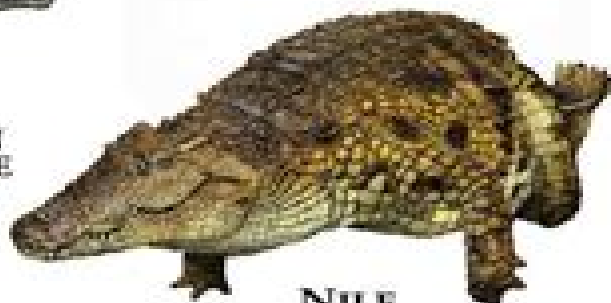
NILE CROCODILE Crocodylus niloticus