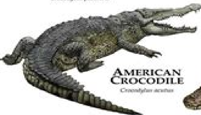
AMERICAN CROCODILE Crocodylus acutus