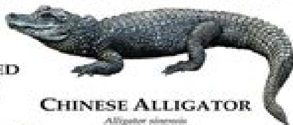
CHINESE ALLIGATOR Alligator sinensis