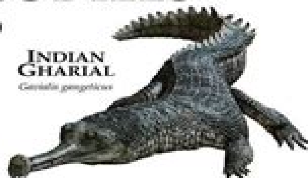
INDIAN GHARIAL Gavialis gangeticus