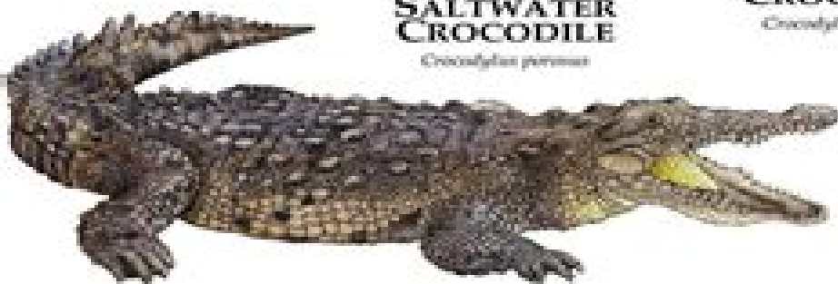
SALTWATER CROCODILE Crocodylus porosus