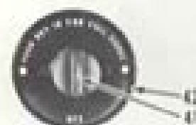
PANEL USED WITH ELECTRIC MODELS ONLY