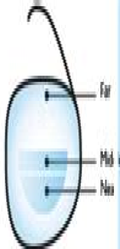
TRIFOCALS Correct near, middle, and far vision