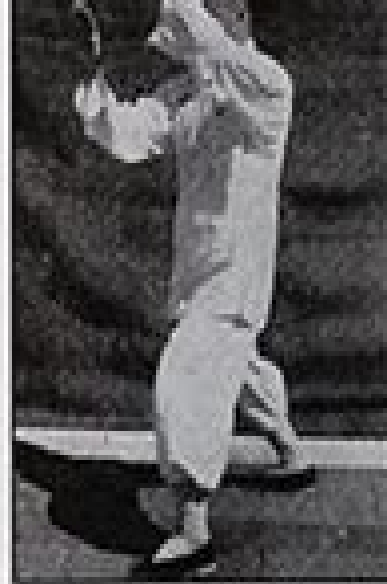
1. 左盤手 2. 轉身 3. 左上步、右穿腕 Fair lady weaving at shuttles (1)