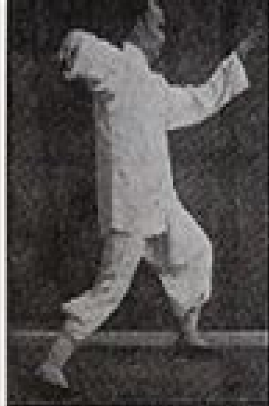
1. 盤手 2. 左進 3. 右腕 4. 另手 5. 鞭掌 Single whip