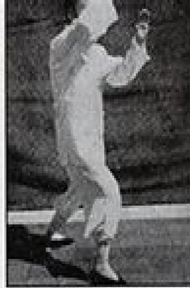
1. 左迴勢 2. 轉身 3. 右上步、左穿腕 Fair lady weaving at shuttles (2)