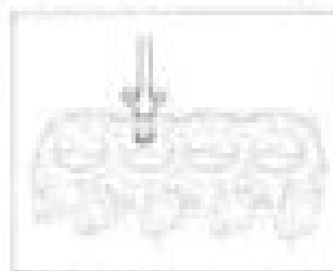
Removing the HO 8-1100-07