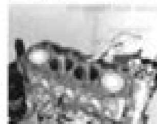
Removing the HO 8-1100-06