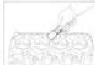
Removing the HO 8-1100-08