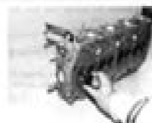
Removing the HO 8-1100-05