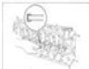
Removing the HO 8-1100-02