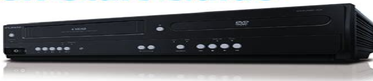
DV220FX4 DV220FX4 A