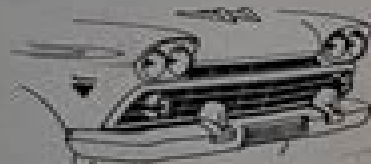
1959 Series 10 Rambler Series 20 Rambler Rebel