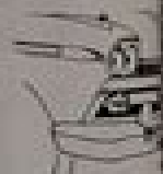
1959 Series 10 Series 20 Rambler