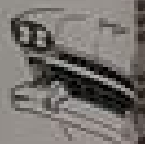
1957 Series 10 Series 20 Rambler