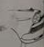
1960 Series 10 Rambler