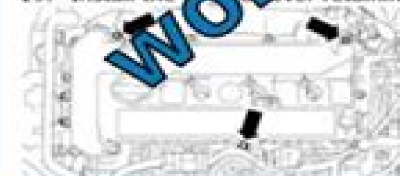
Image shows engine with valve cover

19. Install the valve cover retaining brackets.