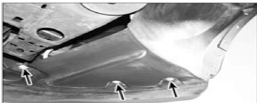
22.2a Remove the fasteners from the front area of the inner fender liner...