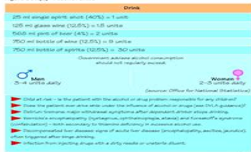
(b) Fast Alcohol Screening Test (FAST)