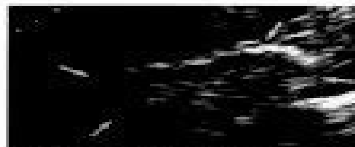
Fig. 8.2. Chronic renal failure. Small size (normal), irregular, pyelonephritis, and irregular borders.