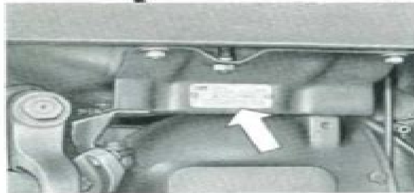
Fig. 3. - Identification Data Plate.